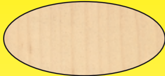
VENEER COLOUR BEFORE STAINING

Due to printing limitations the colours shown are ONLY to be used as guides.