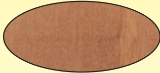
LIGHT HONEY PINE