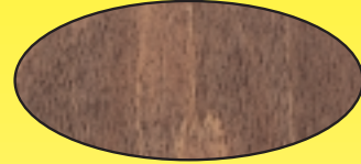
ENGLISH MID OAK