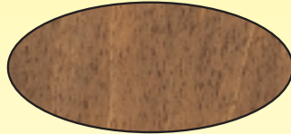
DARK HONEY PINE