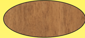
ENGLISH LIGHT OAK